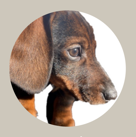
Dash Chief Biscuit Muncher

INTERESTED TO KNOW ABOUT OTHER SERVICES WE PROVIDE? VISIT: <u>WWW.NATALIEROUKININTERIORS.COM/SERVICES</u>