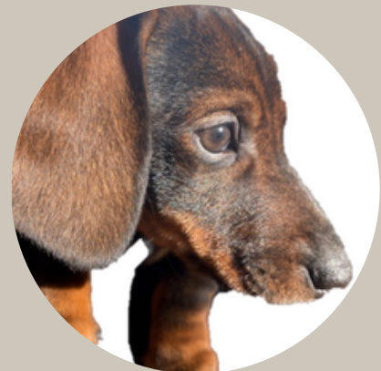
Dash Chief Biscuit Muncher

FILL IN THE CONTACT PAGE ON OUR WEBSITE TO START THE PROCESS WWW.NATALIEROUKININTERIORS.COM